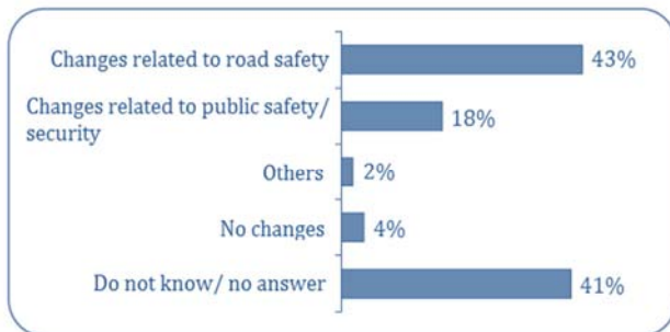
Figure 2. Changes that would be performed in the city to make it safer for children.

Most of the children states also that, to feel safer in their city, it should occur changes related to road safety (43%), most notably greater respect for traffic rules (9%), to reduce traffic (8%), to install more lights (6%) and to make more parks and playgrounds for them (6%). This data is contained in the Figure 2.