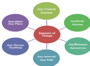
Figure 1. Dimensions of IoT [10]

According to these definitions, Figure 1 shows the dimensions of IoT.