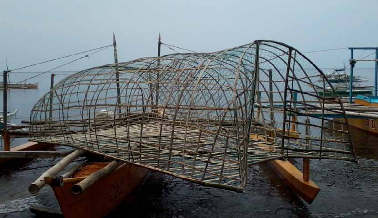
A small-scale fish trap locally known as a “bobo”