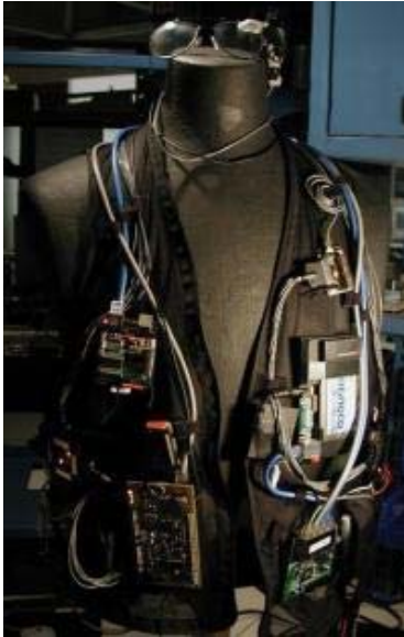
Figure 4: MIThril vest.

As an application of this architecture a reminder delivery system, called Memory Glasses , was developed, which acts on user specified reminders such as “During my next lecture, remind me to give additional examples of the applications of wearable computers”, and requires a minimum of the wearer's attention. Memory Glasses uses a proactive reminder system model that takes into account: time, location and the user's current activities based on daily events that can be detected such as entering or leaving an office.