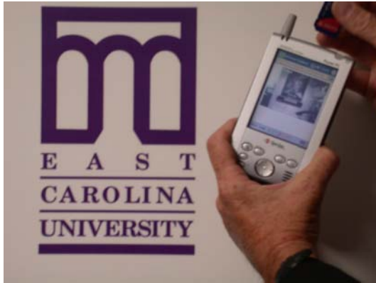
Figure 7: Convergence device consisting of Sprint PCS 3G Smart Phone, Toshiba 2032 PDA, with SD card slot and access to 802.11b WiFi.

include access to email, web pages, electronic resources and examinations enabling students to hot sync from their desktops. This approach to “snatch and go learning” enables mobile professionals to learn from updated content [Du Vall, pers. comm., 28 th May 2003].