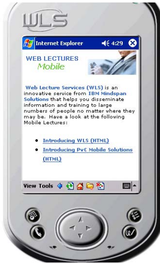
Figure 6: IBM Web Lecture services.

Messaging Services] for delivering updated activities to the learner. In this way, the IBM web lectures can be delivered to the mobile devices such as PDAs or mobile phones [Figure 6].