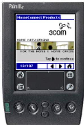
Figure 5: 3COM Learning Assistant. Image reproduced courtesy of RWD Technologies

The 3Com Learning Assistant uses Palm's for delivering learning content to the learner [Figure 5]. Data can be delivered in text or graphical form. The assistant offers Palm Conversion Tool functionality, a simplified authoring environment and an intuitive hierarchical structure [Metcalf 2001].