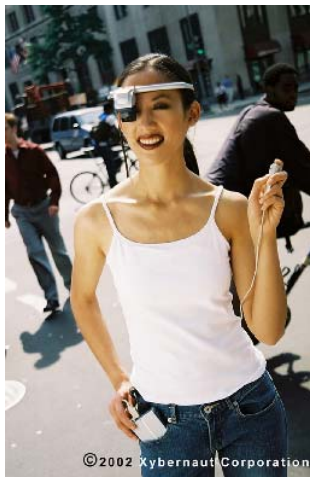
Figure 2: The Xybernaut Mobile Assistant. Courtesy of Xybernaut Corporation.

( www.xybernaut.com/Solutions/product/mav_product.htm )