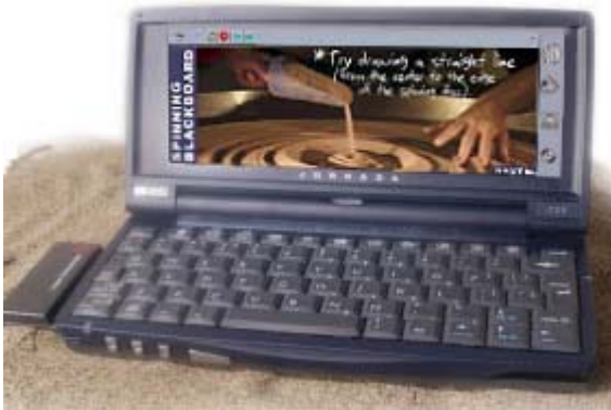
Figure 9: Electronic Guidebook.

The Rememberer , a tool for recording museum visits, is part of the Electronic Guidebook project at the San Francisco Exploratorium, which is investigating the use of handheld devices to enrich learning experience for museum visitors. An important goal of the project is to allow both individuals and groups of visitors a continuum of activities before, during and after the visit, to create an