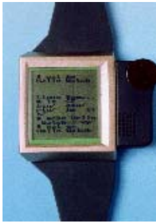
Figure 1: The IBM Linux Watch (Version 1) by IBM Research. Image reproduced by kind permission of IBM research.

( www.research.ibm.com/WearableComputing/factsheet.html )