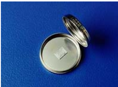
Figure 3: iButton can. Image reproduced courtesy of iButton, which is a registered trademark of Dallas Semiconductor/ Maxim Integrated Products.

iButtons developed by Dallas Semiconductor Corporation/Maxim are currently being piloted in a range of educational institutions. An iButton is a computer chip enclosed in a durable stainless steel can. Each can of an iButton has a data contact (called the lid) and a ground contact (called the base), which are connected to the chip inside the can [Figure 3]. By touching each of the two contacts it is possible to communicate to an iButton, and iButtons are distinguished from each other by each having a unique identification address. By adding different functionality to the basic iButton, such as