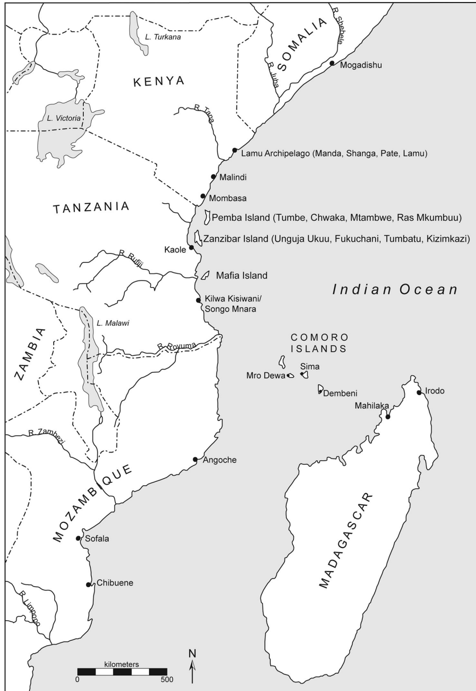
FIGURE 1. Eastern African Coast with sites mentioned in the text.

the 11th century and people were moving into Chwaka and other towns.