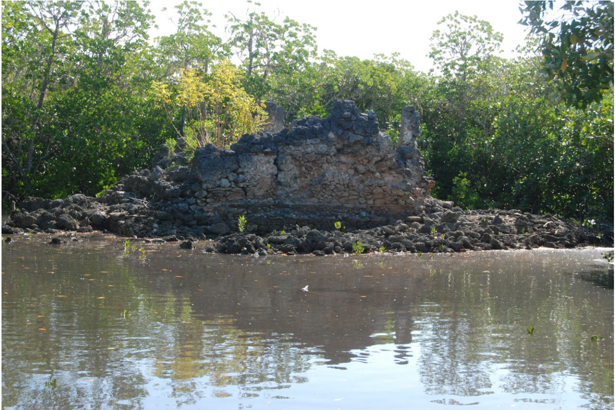
FIGURE 3. “Mnara” mosque at Songo Mnara.