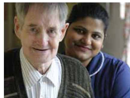
The DCC3 programme was needs-led and accessible to staff of any discipline

Unscheduled admission to hospital should be avoided (Russ et al, 2015); not only is this costly to the NHS, but it is most commonly not the preference of those with dementia (Iliffe et al, 2015; DH, 2013). The Care Quality Commission (2013) identified that the number of multiple emergency admissions is estimated to be 10% higher in people with dementia than those without; length of stay has also been estimated as being 27% longer and the number of deaths in hospital is more than a third higher in this group (36%). A study in one North London hospital also found that people with dementia had half the survival time of those without the condition