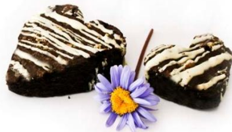
Heart Chocolate Brownies