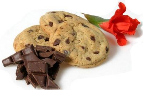
Choc Chunk Cookies

The Khayelitsha Cookie Company produces and sells a wide variety of cookies, biscuits and brownies, including: