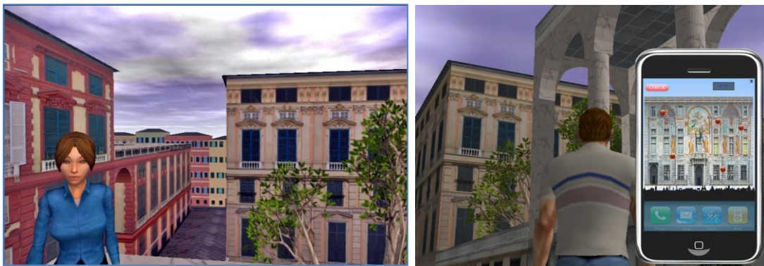
Figure 2: Avatar and PoIs within the VW (left) and a Smartphone interface for tasks interaction (right)