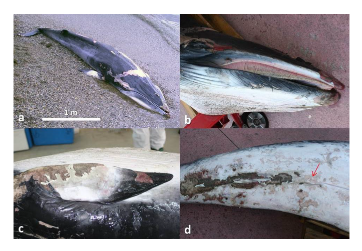
Figure 1–(a) The suckling calf of CMW stranded at Salerno in 2010. Particular of the head (b), flipper (c) and ventral view: the arrow indicate the umbilical scar (d).

record, in the Black Sea (Notarbartolo di Sciara and Demma, 1997; Reeves and Notarbartolo di Sciara, 2006; Notarbartolo di Sciara and Birkun, 2010; Podestà et al., 2014; Cagnolaro et al., 2015). Genetic tagging with DNA markers is a suitable tool for assessing the genetic composition, migratory movements, site fidelity and genetic effects of overexploitation, already successfully used in other Mediterranean whales (Caputo and Giovannotti, 2009). On April 01, 2010, a young specimen of CMW was found beached lifeless at Santa Teresa beach (Salerno, southern Italy), (Fig. 1a-d). This individual was a very young male of 3.30 m body length (head-to-tail length). The carcass was in good preservation conditions, at the initial stage of decomposition (Code 2, fresh carcass) according to Geraci and Loundsbury (2005). The umbilical scar was still neither completely healed nor completely reepithelized (Fig. 1d). Even if the external examination showed a rather poor nutritional status, the measurements of blubber (2.0-5.0 cm) were in the standard range and, during necropsy, milk was found within the stomach chambers, while the intestine was completely devoid of contents. This indicates that the whale died shortly after suckling (Harms et al., 2008; Shoham-Frider et al., 2014). Finally, the examination of the carcass revealed that the cranial bone sutures were not completely closed.