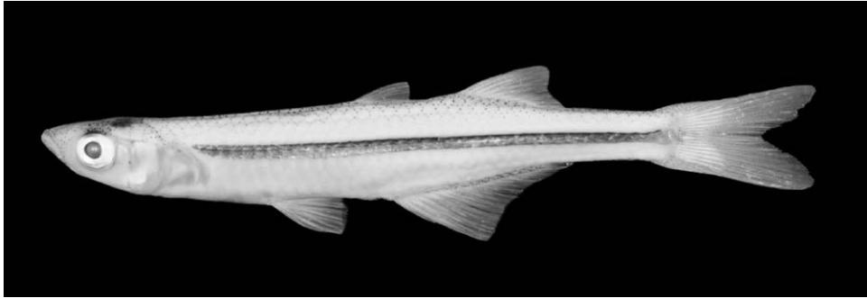
Fig. 1. Specimen of Menidia audens , 47.8 mm SL, Los Angeles County, Malibu Lagoon, 17 November 2006, from LACM 58123-1, pectoral fin removed to show lateral pigmentation.

2, 10[53–85]), Malibu Lagoon (58123-1, 20[47–58]), and the Santa Ana River (58117-1, 20[55–72]). Three Malibu fish had anomalous gaps in the gill raker spacing near the lower end of the row and were excluded from those counts. Three other Malibu specimens had one or a few distinctly foreshortened gill rakers otherwise in normal position and were included in the counts.