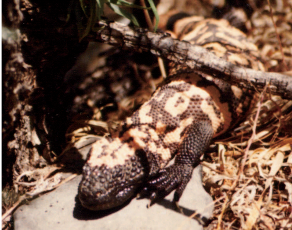
Fig. 4. The Gila monster from Piute Springs (see caption of Figure 3) in riparian streambed. Photo by Ann or Rachel Curren. LACMPC #1364c.

litt. ). When observed, it was in a streambed among vegetation and surface litter. The temperature at the time was 18.3° C under sunny, mostly clear skies with winds of 8–16 kph. It had rained “several” days prior to the observation. The elevation at the site is 853 m. Piute Creek is the only perennial stream for many kilometers around and is characterized by typical desert riparian plant species including Salix sp., Baccharis viminea , Prosopis sp., and Tamarix ramosissima . A subsequent herpetological survey of the site did not detect Gila monsters (Hazard and Rotenberry 1996).