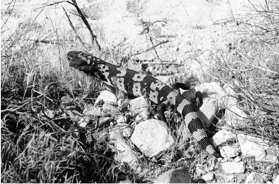
Fig. 6. Gila monster from the Kingston Range, San Bernardino County, California, 1.4 km west Porcupine Flats. Photo by Randall Ford, 30 May, 1980. LACMPC #1329.

Clark Mountain. —At almost 2,400 m, Clark Mountain is the highest of the east Mojave sky island mountain ranges in California. Bradley and Deacon (1966) reported a specimen collected from the eastern slope of the Clark Mountains in 1962 now in the collection of the Marjorie Barrick Museum of Natural History at the University of Nevada, Las Vegas (#R 665, Figure 9). The snout-vent length of the specimen is 267 mm with a total length of 40.5 cm. This collection site is about 11 km southwest of the California-Nevada state line. Several other specimens were reported from nearby Clark County, Nevada, and all were collected at elevations below 1219 m (Bradley and Deacon 1966).