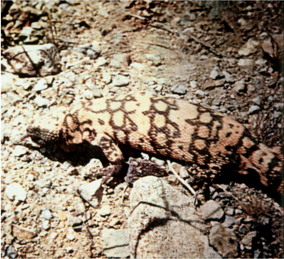
Fig. 2. The Gila monster from the Providence Mountains, Vulcan Mine Road, 16 April, 1968, 1000 hr. Photo is catalogued as Los Angeles County Museum Photographic Catalog (LACMPC) #1331.

is not the westernmost record of Gila monsters from this area (Funk, 1966). Due to the meandering course of the Colorado River, specimens from near Yuma, Arizona were found about 14.5 km west of the California record above.