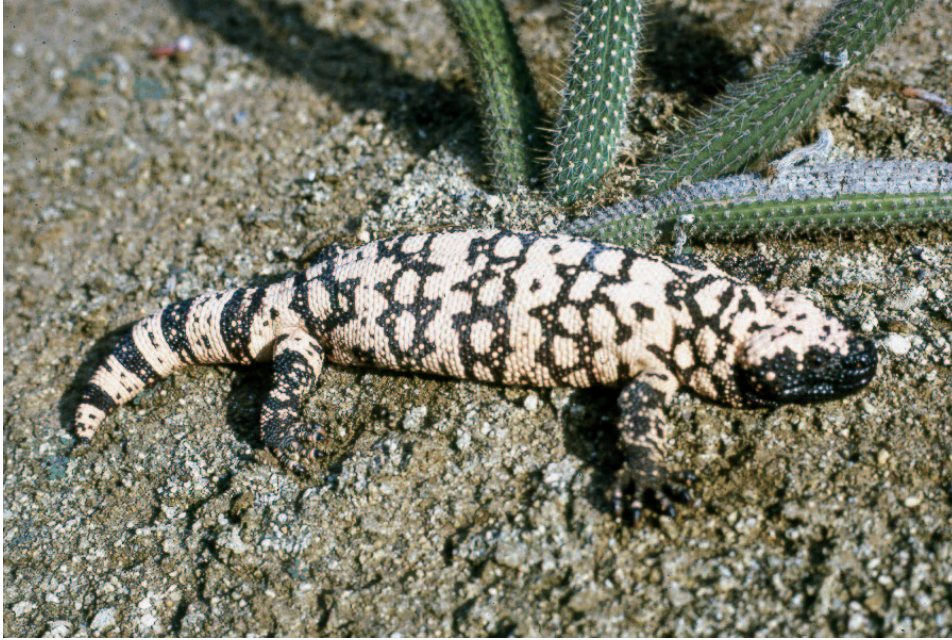
Fig. 3. Same Gila monster in Figure 3 photographed while at the Los Angeles Zoo.

desert at that time, and the fact that the specimen was diagnostic of the geographically expected race, H. suspectum cinctum . Figures 2 and 3 clearly show the banded pattern typical of this subspecies. De Lisle (1986) indicated that specimens from the Providence Mountains were mostly pink with a reduction in black pigmentation relative to other H. suspectum .