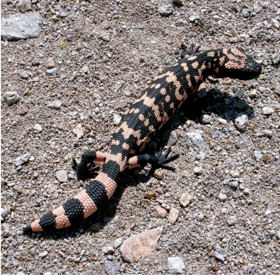
Fig. 8. Gila monster from the Kingston Range, San Bernardino County, California. Details of the sighting will be reported elsewhere.