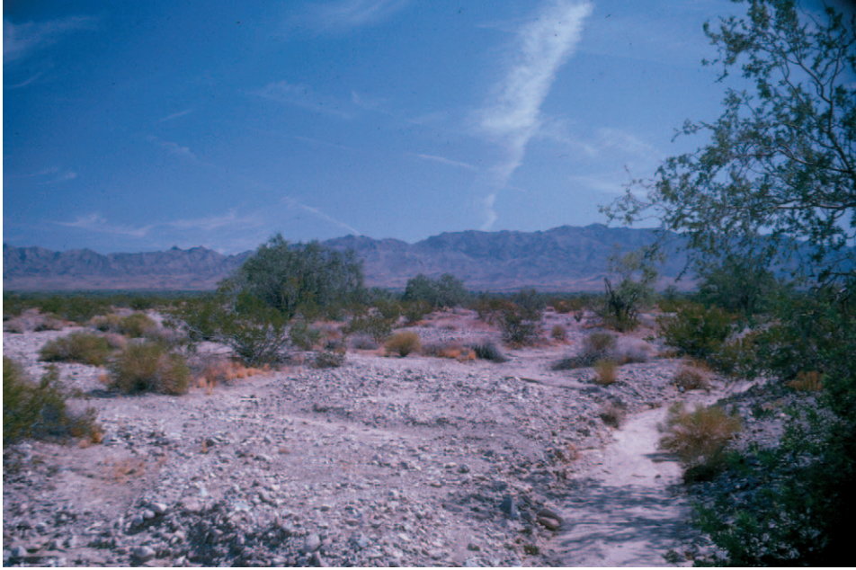
Fig. 1. Ironwood wash woodland near Palen Pass, Riverside County, California. Granite Mountains are in the background.

hillslopes (Figure 1). The Chuckwalla Valley ranges from 200–350 m at the base of the Granite Mountains.