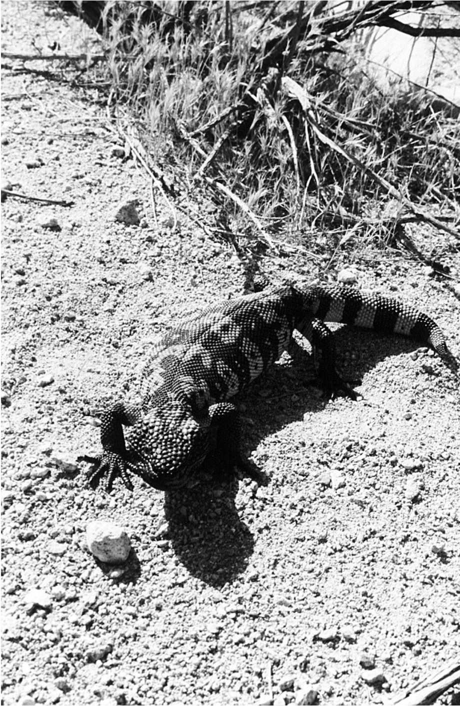
Fig. 7. Gila monster from the Kingston Range, San Bernardino County, California, 1.4 km west Porcupine Flats. Photo by Randall Ford, 30 May, 1980. LACMPC #1330.