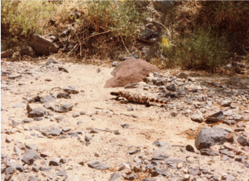
Fig. 5. The Gila monster from Piute Springs (Fort Piute), San Bernardino County, California. LACMPC #1364a.

tons are part of a chain of sky islands with elevations exceeding 2,200 m. The first specimen was sighted, and photographed (Figures 6 and 7), 5.5 km east-northeast of Horse Thief Springs (elevation 945 m) on 4 May, 1980, and is the only documented Gila monster from Inyo County. The second was sighted 1.4 km west of Porcupine Tanks at 1,220 m on 20 May, 1980. The third was seen 2.6 km west of Kingston Peak at 1,130 m on 3 June, 1980. All three occurred in sandy washes associated with large boulders. Plant species in the area included catclaw acacia ( Acacia greggii ), burrobush ( Ambrosia dumosa ), Death Valley ephedra ( Ephedra funerea ), creosote bush ( Larrea tridentata ), and desert almond ( Prunus fasciculata ) (Ford 1981).