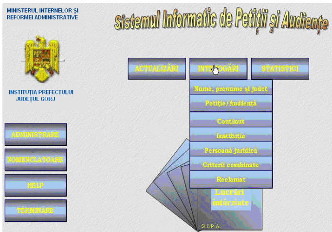
Fig.2: Application menu

This informatics system has as a purpose the evidence of the received petitions and their solving. The architecture proposed for the accomplishment of the integrated informatics system in public administration is the WEB architecture, based on the use of Internet communication technologies, having as components relational, unique data basis. The application is organized on five modules. In order to open the application, one has to open Internet Explorer and to type http://localhost/Sipa/Login.aspx in the address bar. For the client stations, one has to replace the local host with the server's IP. In the connection screen, the user must type a valid username and password. If the username and password are correct, the menu of the application presented in the below figure will open: