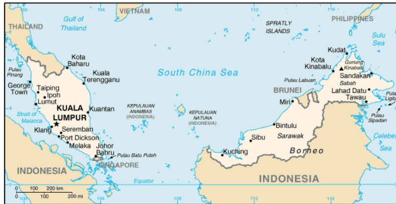
Figure 1: Map of Malaysia (Peninsular Malaysia and East Malaysia).