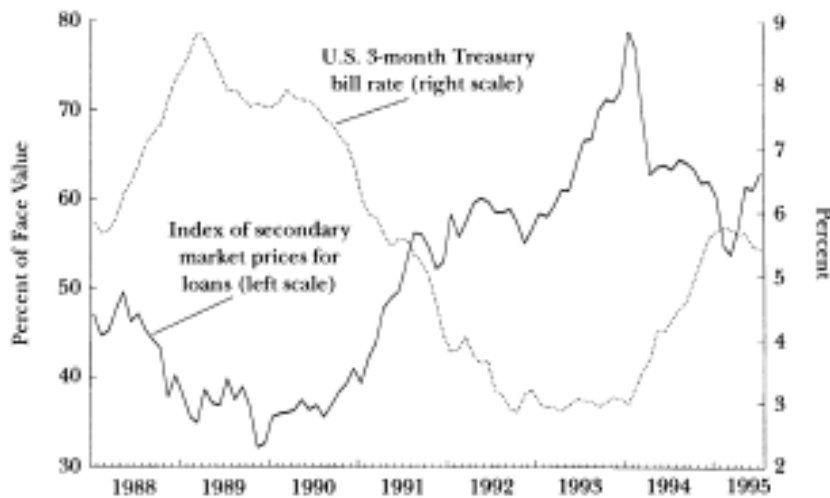
Figure 2 Secondary Market Prices for Loans and U.S. Interest Rate

Note: Index is an average of bid and offer prices for Argentina, Brazil, Chile and Mexico. Sources: Salomon Brothers, Inc., ANZ Bank Secondary Market Price Report and International Financial Statistics, IMF.