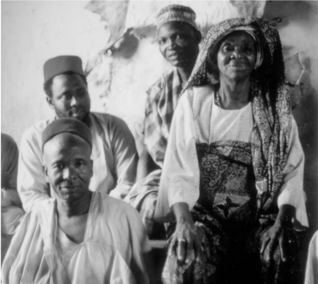
Fig. 1: The The Lelu of Dabba (Trans-Kaduna) with her entourage in 1982.

ballot system“ was still in practice at that time, the above mentioned threat proved to be very effective indeed, because the voters had to queue behind their candidate.