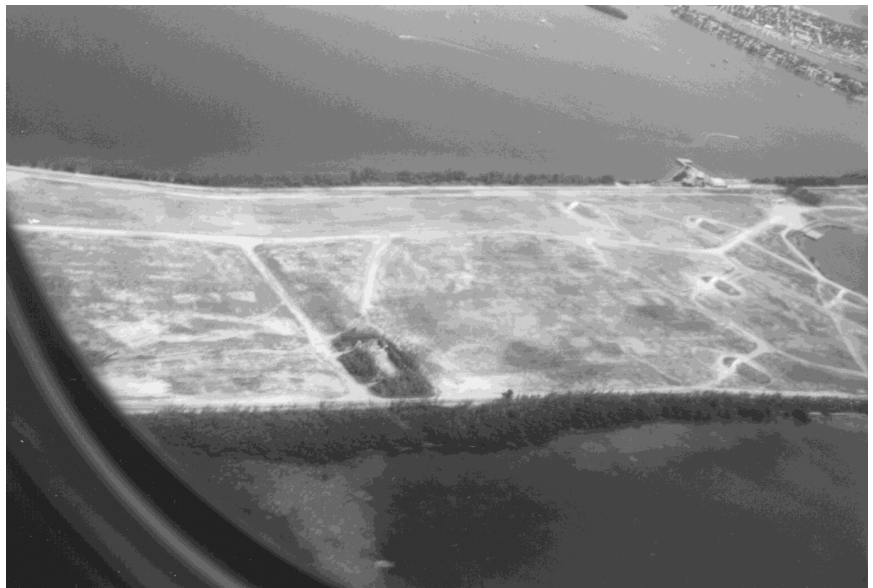
Habitat liquidation is a prerequisite of economic growth, consistent with the principle of competitive exclusion. In the Florida Keys, mining, agriculture, and subdivision development are often found in close proximity.

This does not imply that privately funded habitat acquisition is bad for conservation, especially relative to other expenditures. It implies, however, that habitat will become unavailable for acquisition as habitat is liquidated to generate funding. The unlikely alternative is a perpetually growing economy on a perpetually diminishing productive land base, as habitat is acquired for conservation and thus taken practically out of economic production. If the latter alternative is not possible (as ecological economics asserts), then a steady state economy with a stable ratio of conserved habitat to economically productive land is a minimum requirement for wildlife conservation. In other words, negative conservation aspects of a steady state economy would be short-term; whatever long-term negative aspects may be associated with a steady state economy would pertain to something other than conservation.