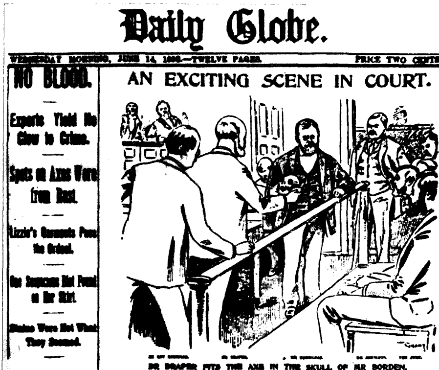
Newspaper Sketch, Doctor Draper Fitting the Axe in the Skull of Mr. Borden, The Daily Globe, June 14, 1893.

comprehensible to the jury, to the spectators, and to themselves. 137