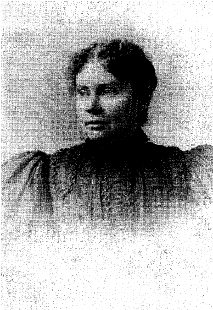
Miss Lizzie A. Borden, portrait photo circa 1890.