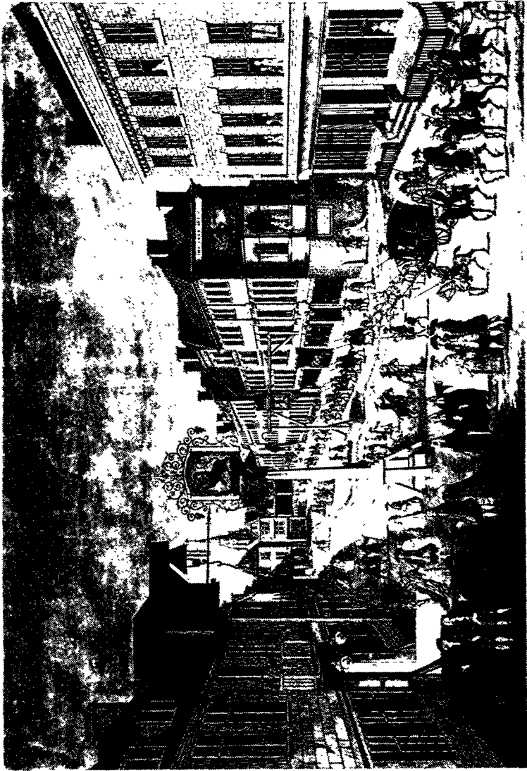
A. W. & Co. Lithographers, Warwick, Warwickshire. Evesham, in Warwickshire, is a town of 10,000 inhabitants. It is situated on the river Avon.