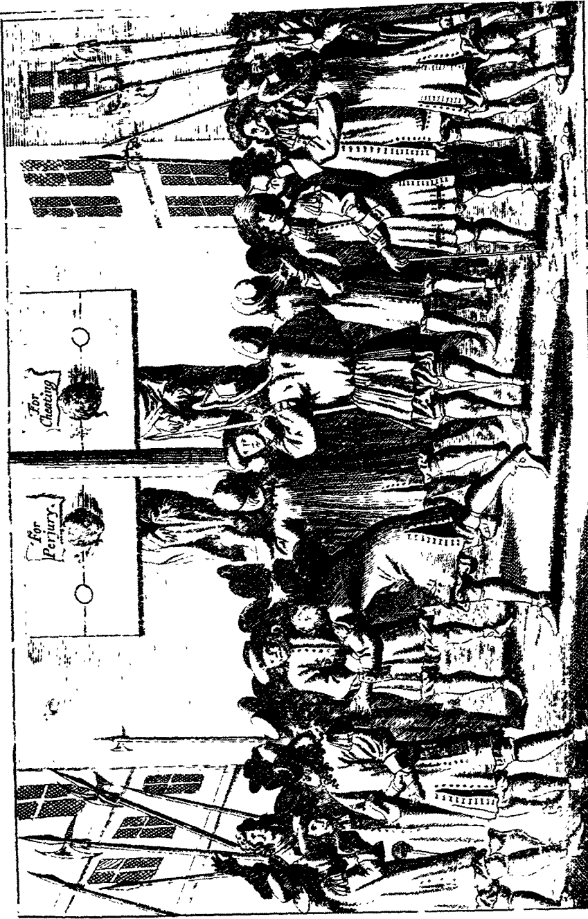
The Punishment of the Pillory for Perjury, Cheating, and other Misdemeanors.