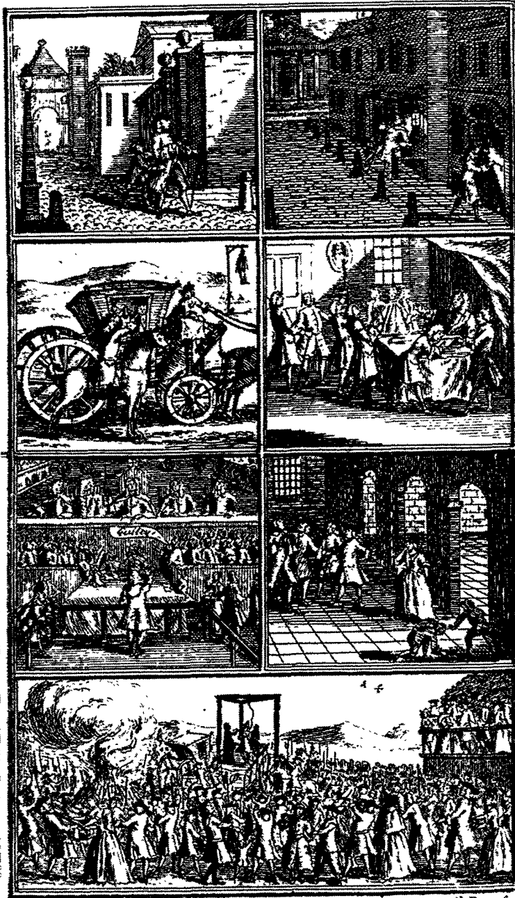
A Criminal Career (1742): pocketpicking leads to burglary, then highway robbery. Once apprehended, the culprit progresses through pretrial examination by the JP, conviction by the trial jury, post-trial detention, and execution.