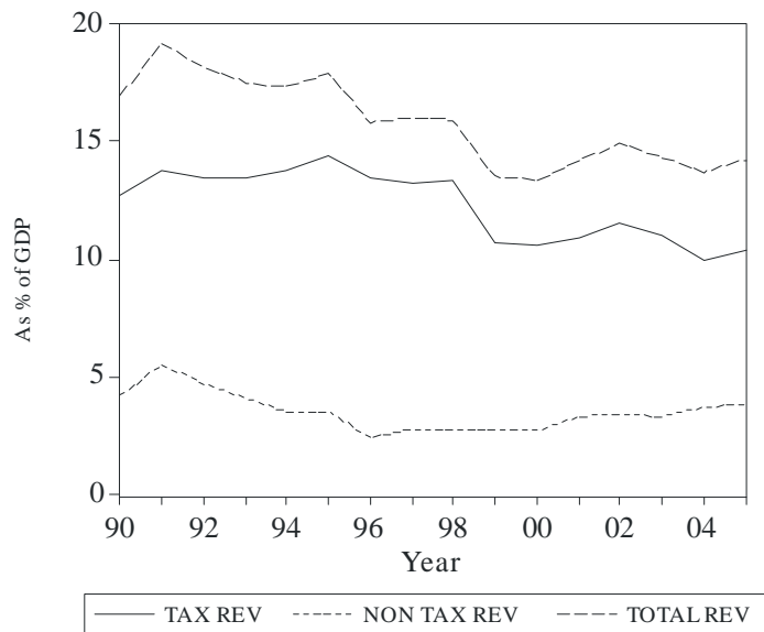
Fig. 2. Share of Revenues Relative to the GDP