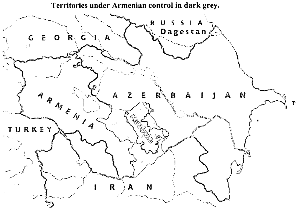
Appendix Figure 1