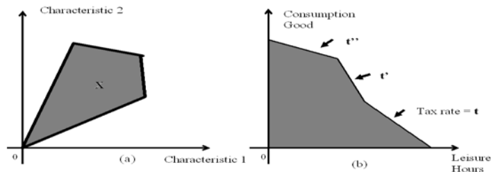
Fig. 1: (a) Lancasterian and (b) Non-Linear Budget Sets

of vectors of goods in a two-dimensional characteristic space).