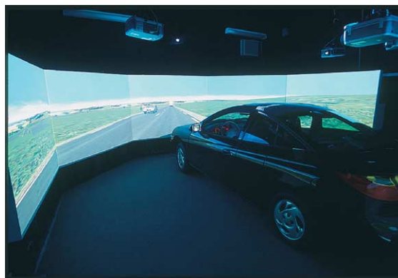
Fig. 3. Virtual driving simulator.