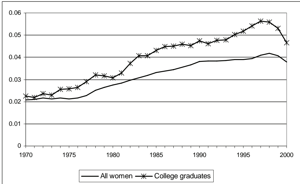
Figure 2: Joint Rate of Child-Bearing and Employment

Data Source: March Current Population Surveys, 1969-2001 (King et al. 2004).