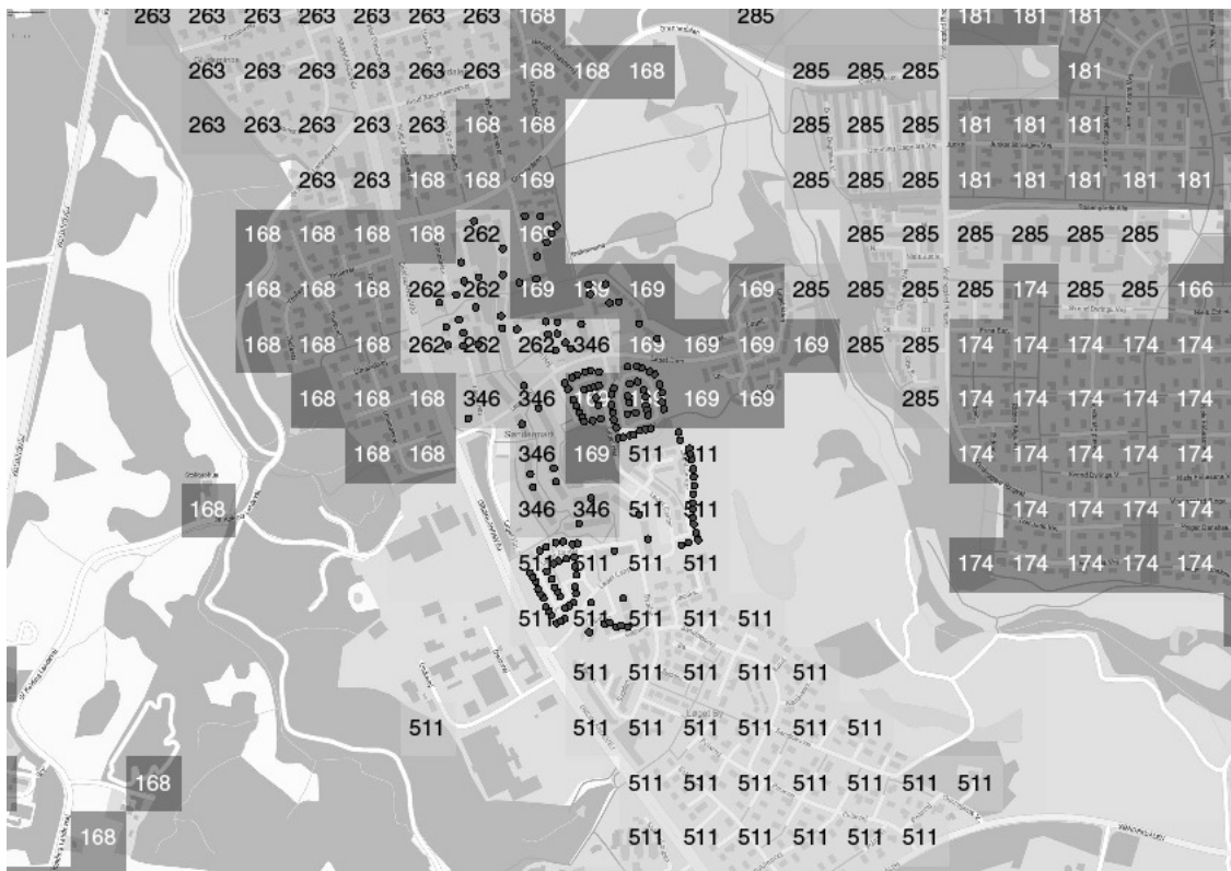
Figure 3 Small neighbourhoods in the area of Løget By, Vejle

Another reason for which we are satisfied with the clustering process in spite of examples such as the one shown in Figure 3 is that the difference in the result of the clustering process reflects differences in the two types of focus area. Focus areas in the provinces (e.g. Løget By) tend to have fewer inhabitants and a lower population density than focus areas in cities (e.g. Taastrupgård). It is therefore not surprising that it is more difficult to delineate focus areas in the provinces.