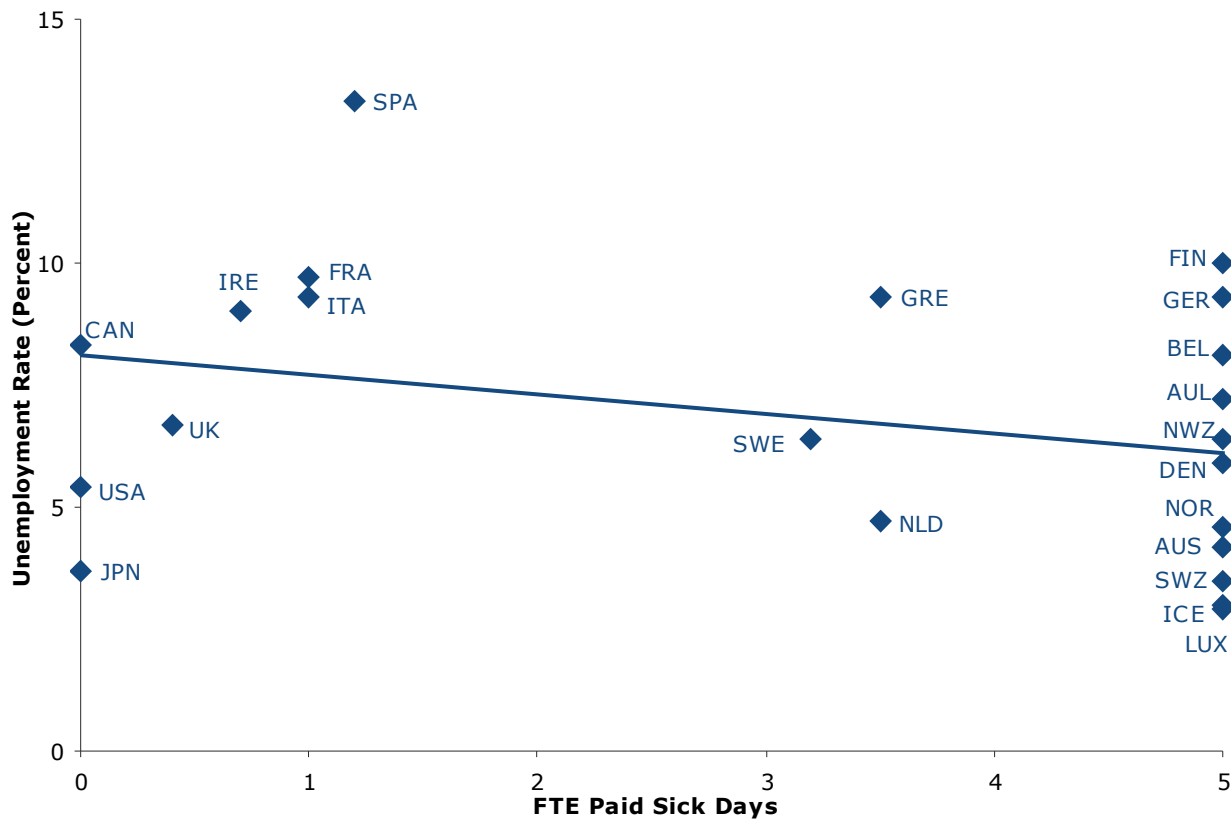
FIGURE 1 Unemployment Rate (1989-2007) and Paid Sick Days