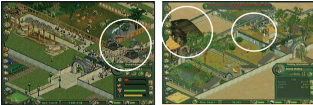
Katarina's zoo: Statues included for aesthetic reasons but no economic benefit.