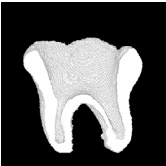
Fig. 1b. Reconstructed representation of external and inner space of tooth