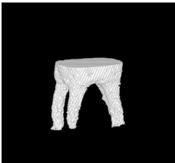
Figure 1g. Reconstructed 3D representation of the plaster models of chambers and root canals of tooth.

bed and applied systems of building three dimensional models representing cavities which make it possible to reconstruct lost fragments of crowns using an insertion with a designed and finely molded shape. Spatial representation of a cavity is obtained by scanning its shape with the use of industrial computed tomography.