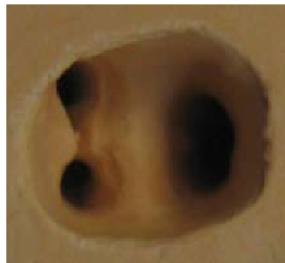
Fig. 1f. The plaster models of chambers and root canals of tooth.