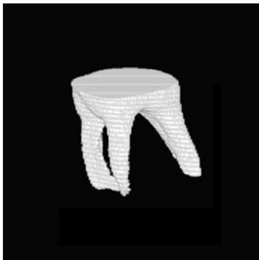
Fig. 1c. Reconstructed 3D representation structure of inner space of tooth after endodontic preparation.