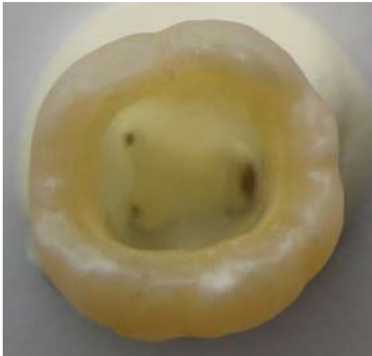
Fig. 1a. Tooth after endodontic preparation.