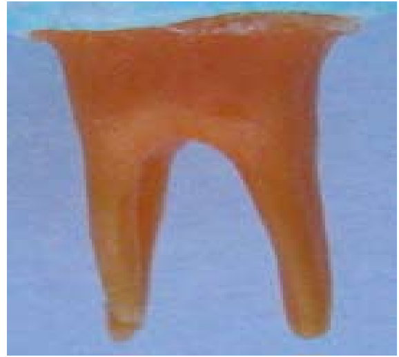
Fig. 1d. Negative polymer representations of inner space of tooth after endodontic preparation.