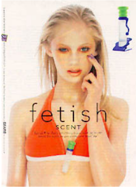
7 Fetish Perfume by Dana, 1997