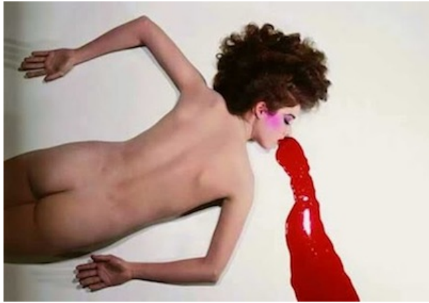
9 Guy Bourdin, unknown