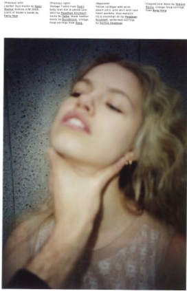
13 Tyrone Lebon, This is pop too: LDN ^ _ ^ , Pop Magazine, 2012.