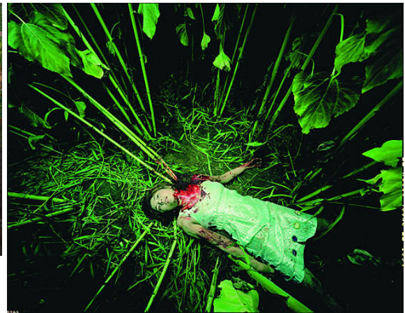
4 Izima Kaoru, Landscape with a Corpse , 1995-2008