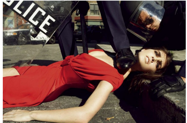
10 Steven Klein, State of Emergency , Vogue Italia, 2006.