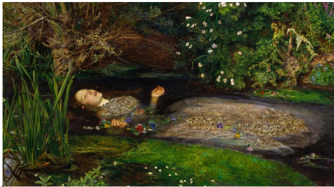
3 John Everett Millais, Ophelia , 1851