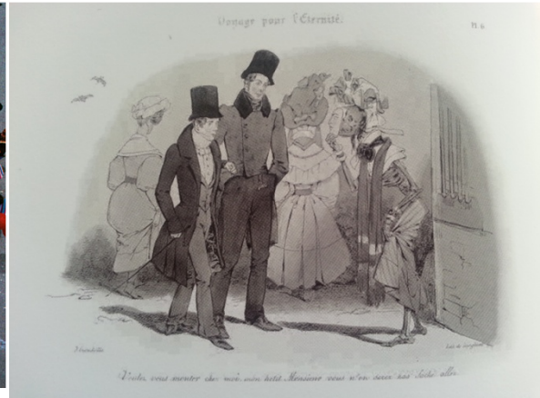
2 J.J. Grandville, Journey to Eternity (Voyage pour l'éternité) , 1830