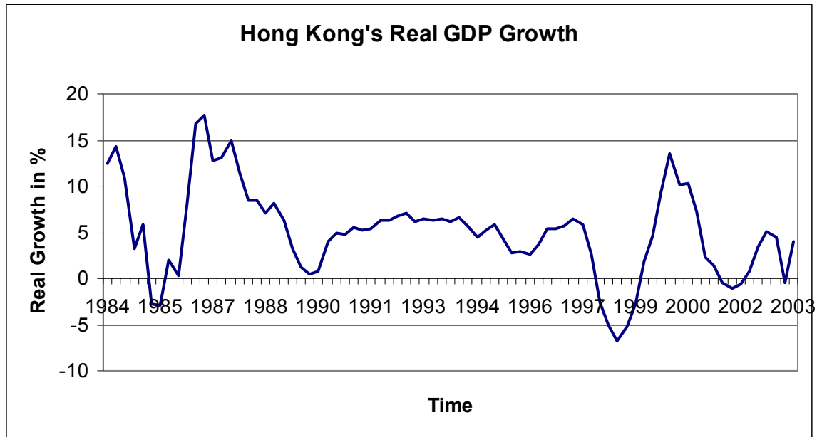
Figure 3: Hong Kong's Real GDP Growth