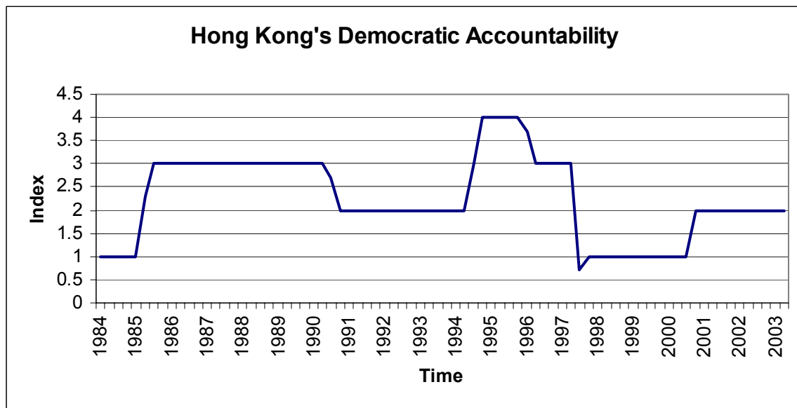
Figure 2: Hong Kong's Democratic Accountability