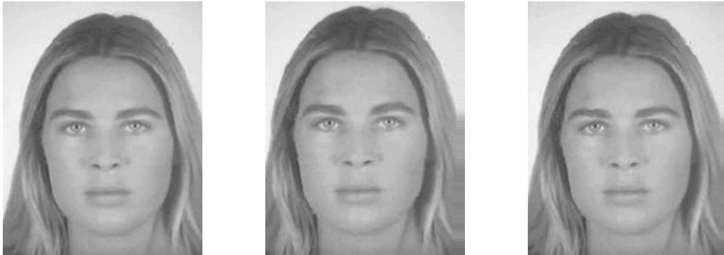
Fig. 4. Image Registration of one individual in the sample