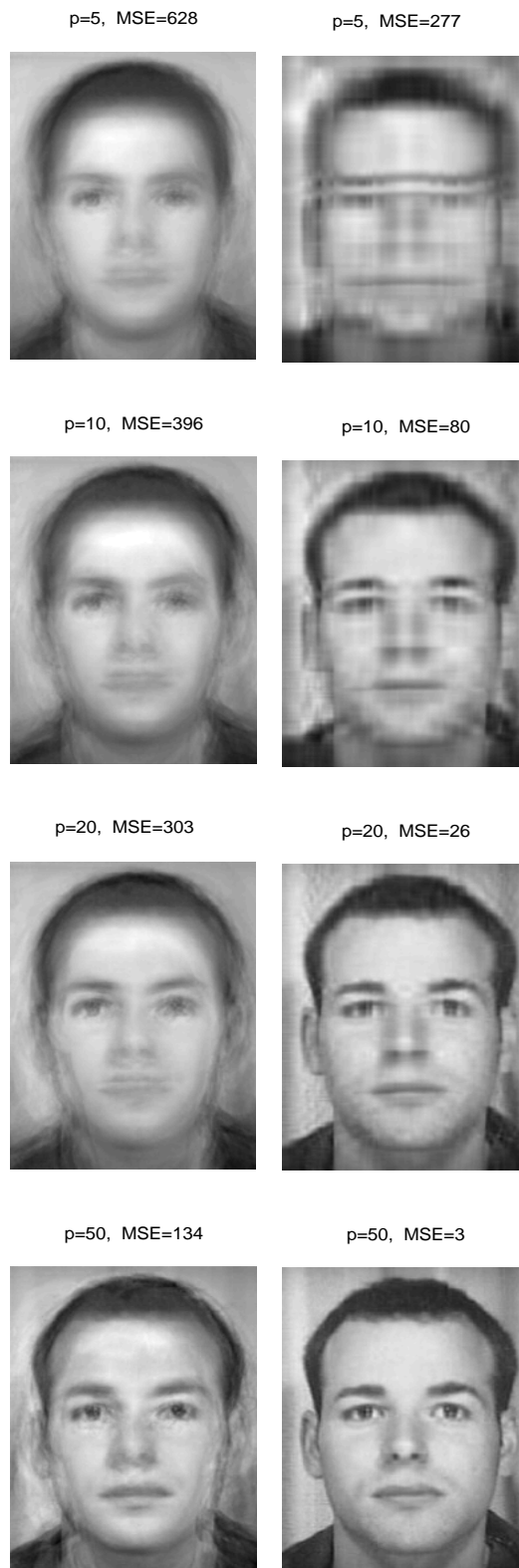
Fig. 2. Image Reconstruction by means of the standard method (left panels) and by the new method (right panels) using p = 5, 10, 20 and 50 singular values