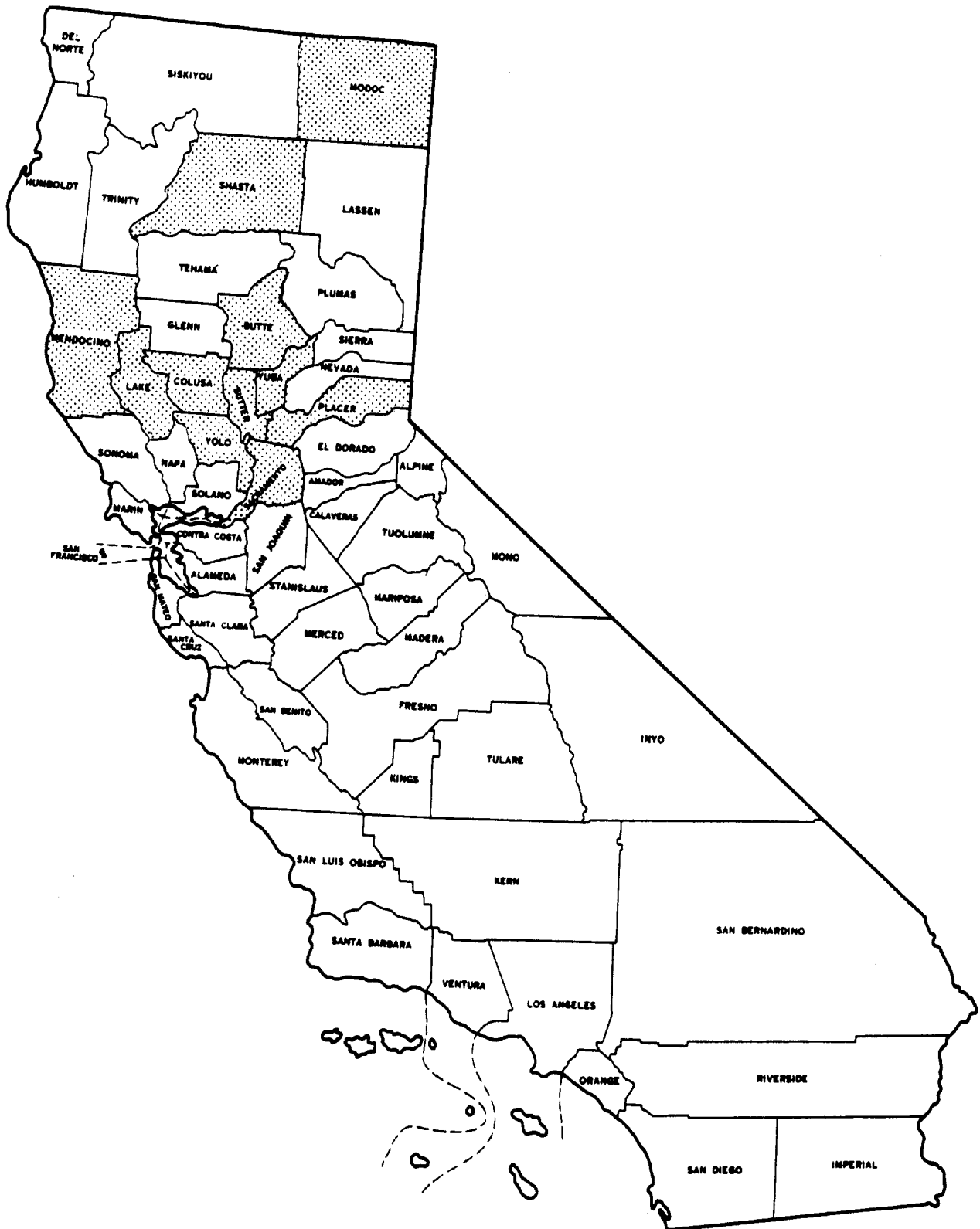
Figure 2. California Counties Producing Wild Rice, 1985 Crop Year.