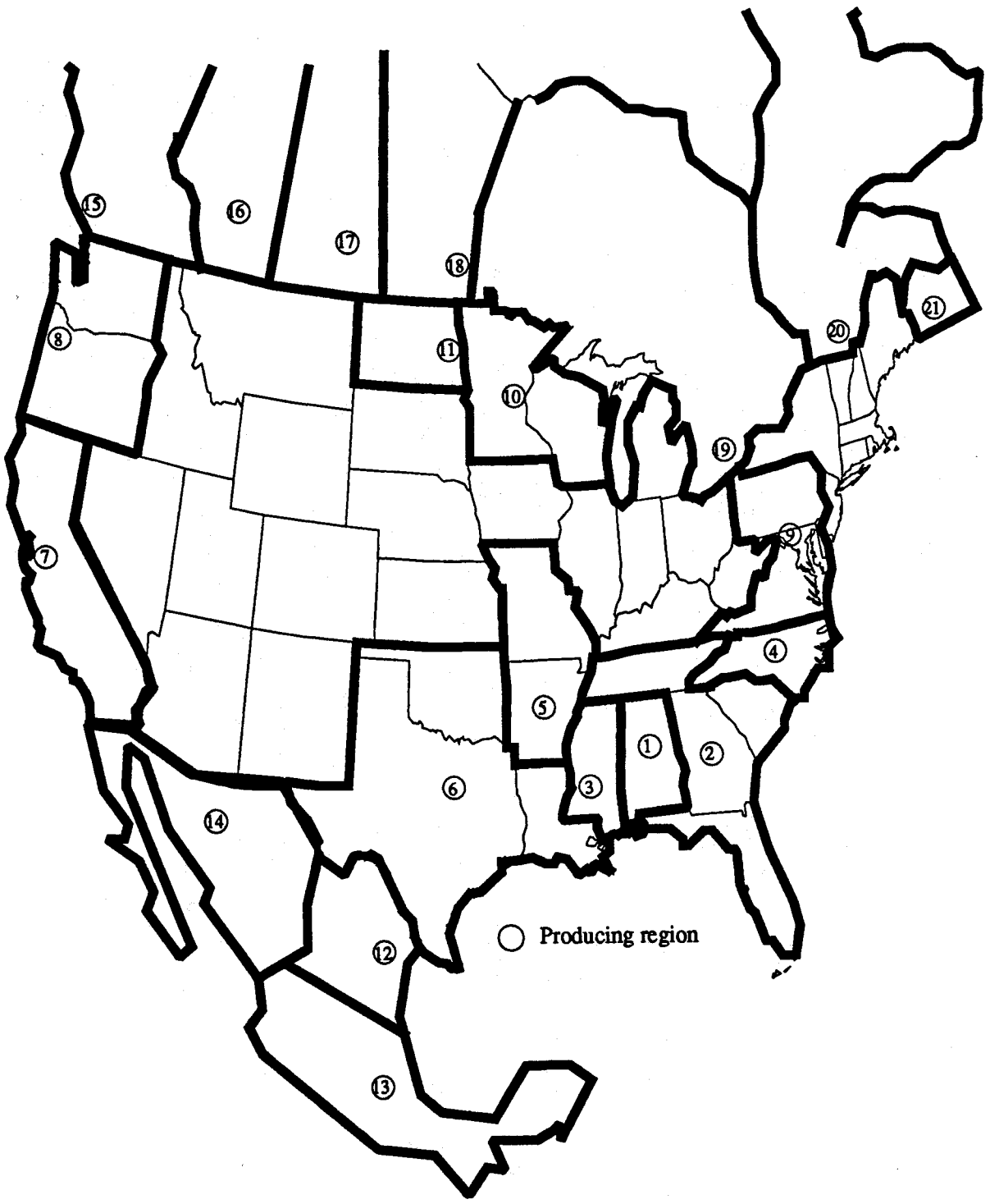
Figure 1. Broiler Production Regions for the United States, Canada, and Mexico