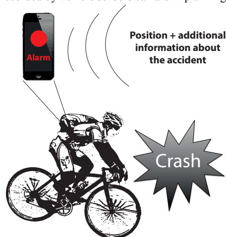
Fig. 2: A smartphone app for bicyclists and other vulnerable road users could automatically send an alarm in case of a crash.