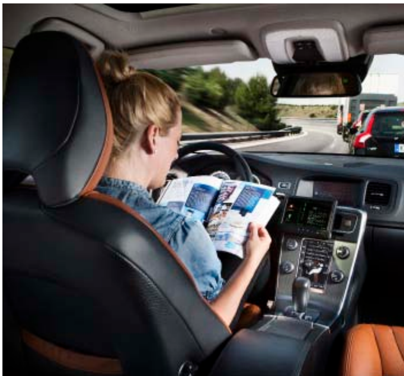
DRIVER DISTRACTION , a side-effect of our sometimes excessively linked-in world, is here not a bug, but a feature. Within a few minutes of joining a platoon, drivers tend to kick back and take their attention from the road.

cial because a driver should never be unsure whether he or the lead car is in control. To avoid any such uncertainty, we have chosen to coordinate these transitions with a user interface that, although new, will still be familiar to drivers because it