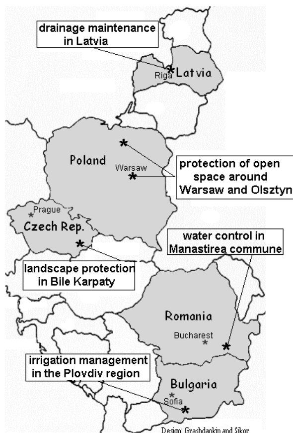
Figure 2: The case studies in Central and Eastern Europe

The current situation is radically different from that under socialist agriculture. Large state farms and co-operatives dominated agricultural production in the case study sites, with the exception of the Polish sites. Large state bureaucracies were the tools for a strongly hierarchical approach to natural resource management, combined with some elements of local-level co-operation in water management. Technical agencies were responsible for the provision of water, construction and maintenance of irrigation and drainage infrastructure, soil conservation programs, urban and regional planning, and the protection of biodiversity. Postsocialist reforms radically altered the institutional framework for the management of common-pool resources as well as rural actor constellations. How agrarian transformations affected the management and state of common-pool resources is the topic of the ensuing analysis.