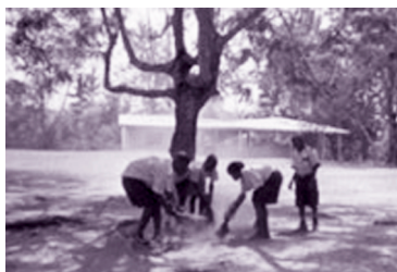
8. Boys don't like it when they have to sweep the school compound. At home, sweeping is something that only girls do.