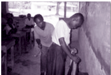
1. We don't like it when the teacher comes us.

The following words and photos are by class JSS1 (year 1) of the Akurase Junior Secondary School, who were asked to document what they disliked about school.