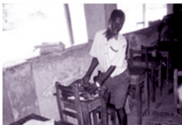
6. We don't like it when people nick things, usually pens, from your bag during the break.