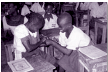
3. We Don't like it when people start fighting in class, usually over pens or something stupid.