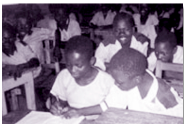
7. We don't like it when people tease you, like when a boy helps a girl with her work for example.