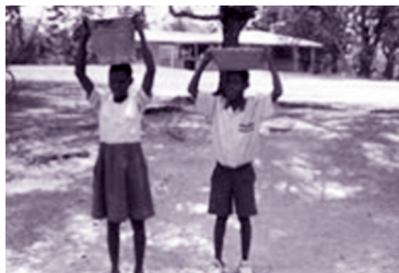
2. We don't like having to fetch water for people to drink during the school day.