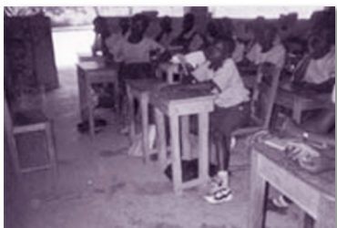
5. We don't like it when the teacher doesn't turn up, it's really boring, you just sit there with nothing to do.