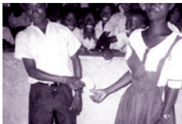
4. We don't like it when people start gossiping, for instance when a boy gives a girl money, they say you're boyfriend and girlfriend and it's really stupid.