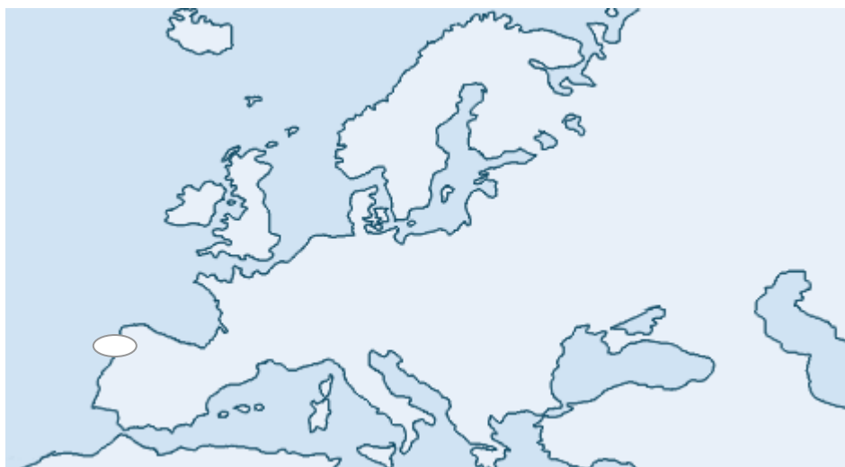
FIGURE 1. LOCATION OF THE AREA STUDIED