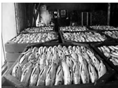
Fig. 2 Fresh fish placed inside the boiling nets

The production of sodabushi involves a number of steps and is essentially the same as the katsuobushi production process. First, fresh fish are placed inside a boiling net (Fig. 2). Second, the fish are submerged in boiling water until well-cooked. Third, the heads and internal organs are removed and the fish are then dried under the sun. This step known as “hadaka-bushi,” is a practice that is widely observed in the Kansai area (Fig. 3). A step whereby the fish becomes covered with mold is known as “hongare-bushi” and is usually seen in the Kanto area. When this process is extended over a three to six month period a richer moldy taste is achieved. Katsuobushi production is mechanized which makes the process simple but sodabushi is made by hand because the small size of marusoda fish makes the machine impractical.