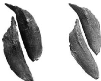
Fig. 3 Hadaka-buzhi (left) and Hongare - bushi (right)

The local women of Tosashimizu play an important role in the production of sodabushi. They perform a step known as “seiro-tori,” the purpose of which is to tighten the meat of the boiled fish (Fig. 4). This also includes separating the bone and the head from the meat and arranging them on the net as carefully as possible which requires skill and expertise on the part of the women. There are 24 sodabushi mills in Tosashimizu and an average of 13 people work in each mill. Marusoda which is caught nearby is processed by local women...a very interesting activity to behold.