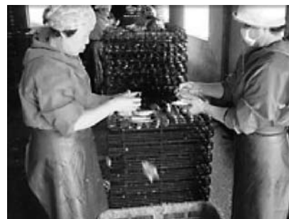
Fig. 4 The step known as seiro-tori

The local women of Tosashimizu play an important role in the production of sodabushi. They perform a step known as “seiro-tori,” the purpose of which is to tighten the meat of the boiled fish (Fig. 4). This also includes separating the bone and the head from the meat and arranging them on the net as carefully as possible which requires skill and expertise on the part of the women. There are 24 sodabushi mills in Tosashimizu and an average of 13 people work in each mill. Marusoda which is caught nearby is processed by local women...a very interesting activity to behold.