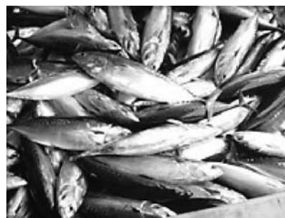
Fig.1 Marusoda caught near Ashizuri Cape

Micronesian waters. The method being used is known as purse seiner net fishing and is accomplished through the following process; First, the fish is enclosed within a large net. Next, the net is wrung just like a bag and then straightened and the fish is then extracted. This can be considered to be the most commonly used fishing method by Japanese fishermen especially in Micronesia and in other foreign seas. On the other hand, marusoda, which is used for making sodabushi, contains a large amount of dark red flesh which rots easily (Fig. 1). This