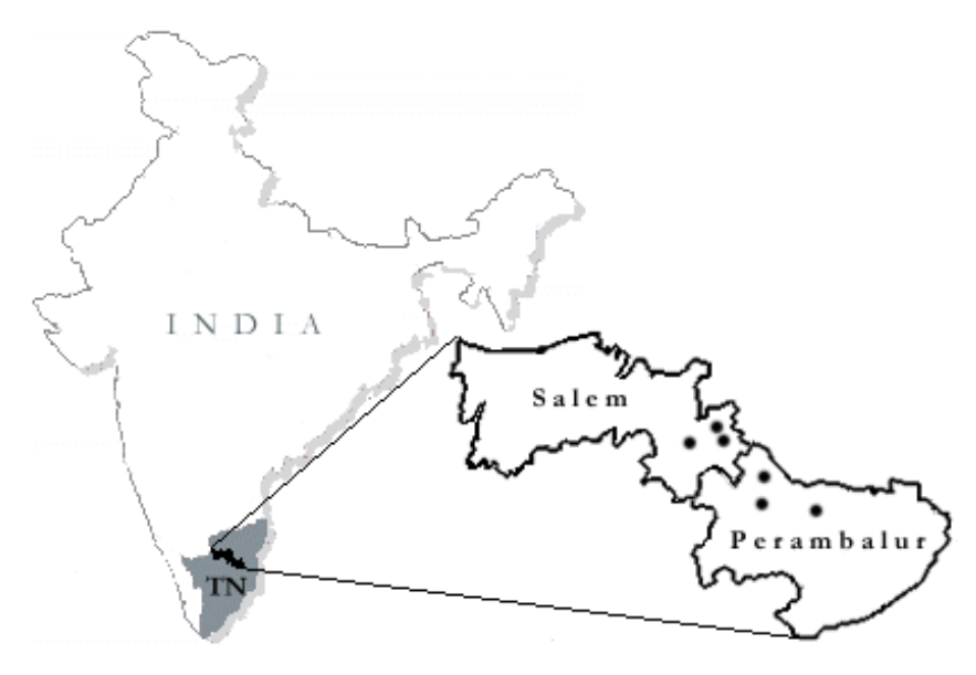
Figure 1 Map of surveyed villages in Salem and Perambalur districts of Tamil Nadu (TN), India (India map courtesy of www.theodora.com/maps, used with permission)