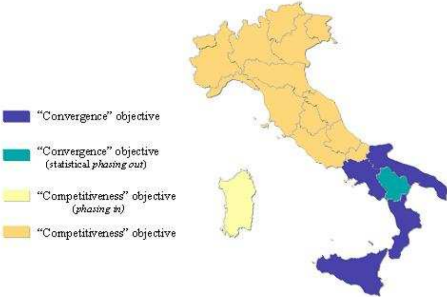
Fig. 1 - Italy: regions Convergence and regions Competitiveness.

Before going through the analysis, it is necessary to consider that a substantial difference characterises Italian regions at the level of EU support: the 4 (plus one in phasing out) regions belonging to the “convergence objective” have at their disposal a greater quota, a minimum of 3,341 million euro, than the 15 (plus one in phasing in) belonging to the “regional competitiveness and occupation objective”, as provided by regulations n. 1698/05. As a result of the decisions settled at a national level on the division of the community fund, all the five convergence regions (figure 1), such as Campania, Calabria, Sicilia, Puglia and Basilicata (in phasing-out), receive approximately an additional 800 million euro more than the minimum level established by the Commission, so the total amount for these regions represents roughly 50% of the entire Italian EAFRD support.