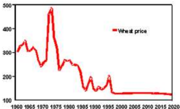
Figure 1. World Cereal Prices, 1960-2020