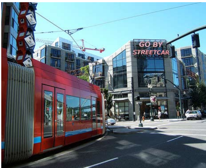
The Pearl District in Portland, Oregon offers transit-rich affordable housing options