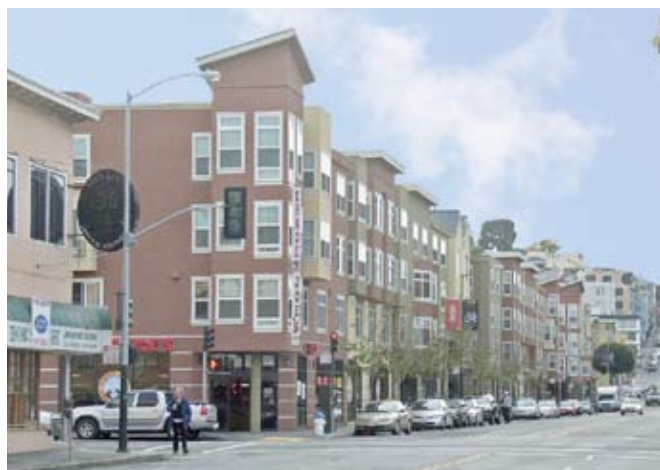
North Beach Place is a HOPE VI project built in 2004 in San Francisco

Ideally, affordable housing would provide not only shelter, but also opportunities for residents to experience social and economic advancement. Unfortunately, many public housing projects that were created with good intentions deteriorated into slums, resulting in a concentration of poverty and a cycle of disinvestment that isolated residents from opportunities for advancement. Policy makers responded by placing increasing priority on the need to deconcentrate poverty and introduced the HOPE VI program in 1992 to transform severely distressed public housing and promote income diversity. The program provides funds for the demolition of severely distressed public housing and the development of redesigned mixed-income housing.