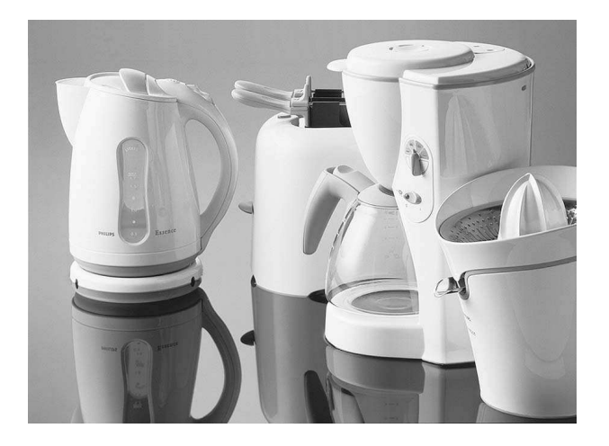
Figure 1: Products of the kitchen appliances range

Company A has its headquarters in the Netherlands and is, with approximately 10,000 employees, part of a much larger multinational group. Company A commercialises small domestic consumer products and works with an internal design team. This internal design team is part of the company's design department with 500 employees. Between 1997 and 1999, Company A developed a range of small kitchen appliances (see figure 1).