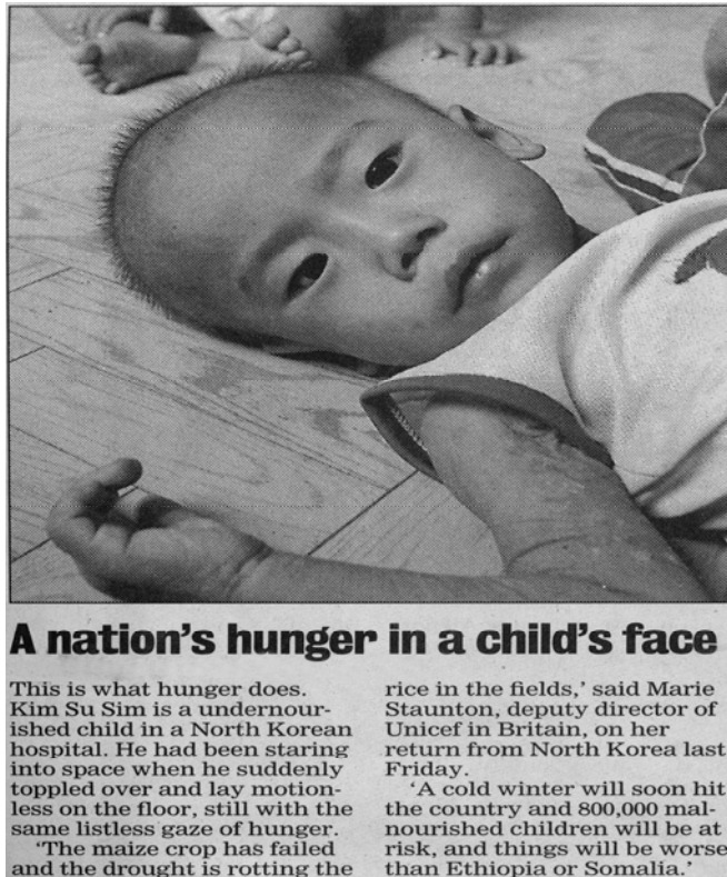
Figure 1: A Nation's Hunger in a Child's Face