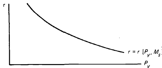
FIGURE 9-1. Graphical Relation Between Prices and the Balance of Payments—Monetarist View

An increase in the price of exports would raise the household's income. So would a rise in the price of the domestic goods since y > y_h . Assume that the household expects such increased income to be temporary and holds real consumption constant. This assumption implies that households engage in short-run hoarding or saving of money in the face of the expectation that real income will fall to