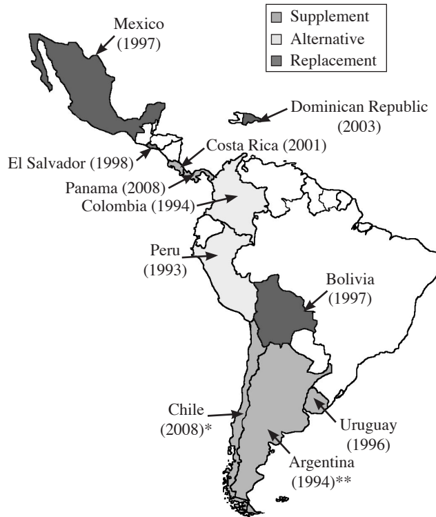
FIGURE 1. INTRODUCTION OF INDIVIDUAL RETIREMENT ACCOUNTS (IRAs) IN LATIN AMERICA, RELATIONSHIP OF IRAs TO EXISTING SYSTEM