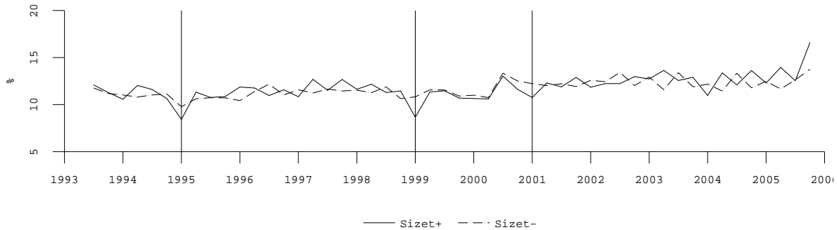
Figure 3: Size of price changes

environment. In an SDP model, firms decide on both the timing and the size of a price change. Assuming stochastic costs of price adjustment, the firm weighs the realisation of the adjustment cost against the effect of adjusting its price on the discounted flow of expected future earnings. So the key implication of SDP models is that firms react to economic shocks by changing the price adjustment frequency as well as the size of the price adjustment. Dotsey et al. (1999) is a prominent example of this type of model.