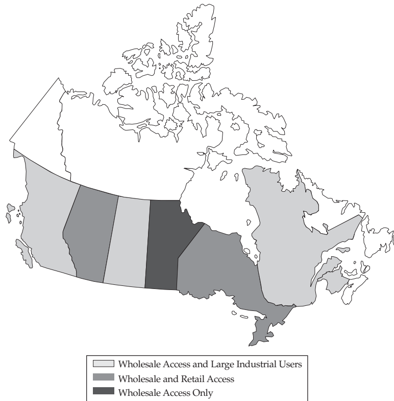
Figure 1: Canadian Restructuring Status (as of 1 April 2005)