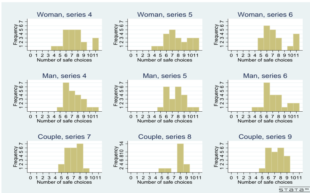
Figure 2: Empirical distributions of safe choices, couple money.

series, the distribution of couple choices is more concentrated than the distribution of spouse choices.