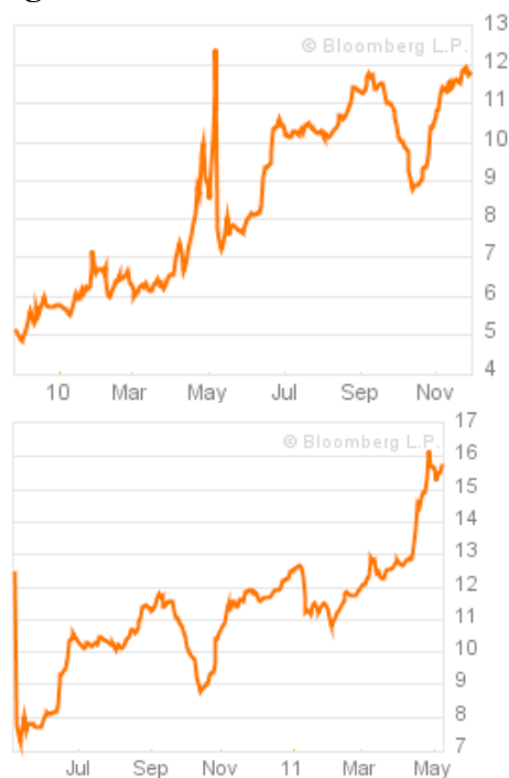
Fig. 3 Yield of Greek 10Y bonds 2010-11 (Bloomberg)

Issues that need to be clarified with respect to the role of CDS on sovereign bonds are basically: the difficulty in CDS clearing and management; the liquidity; the value of the assets underlying the swap contract.